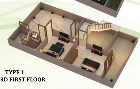
TYPE 1 2D & 3D FIRST FLOOR