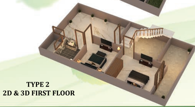
TYPE 2 2D & 3D FIRST FLOOR