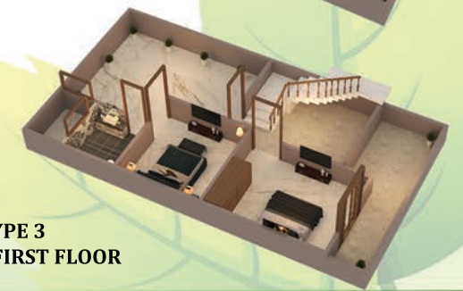
TYPE 3 2D & 3D FIRST FLOOR